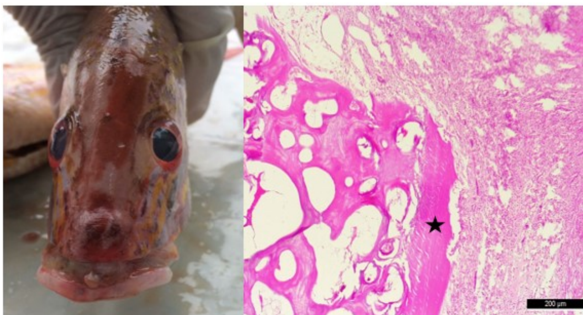
Figure 3 - Lernaeolophus sultanus parasite of Lutjanus synagris . (A) Face deformity; (B) massive loss of bone (asterisk) structure of the maxilla.

In the present study, macroscopic and/or histological alterations found demonstrated the impact of some parasites on the health of the parasitized fish. Besides this, the lesions found also interfere with their commercial value. Histopathological analysis is an important diagnostic tool for detecting the deleterious effects of parasites (Johnson et al., 1993; Feist and Longshaw, 2008), besides being an indicator of the health of the marine ecosystem (Feist and Longshaw, 2008; Roberts, 2012). Fish that are undernourished or exposed to contaminants may become susceptible to deleterious action of parasites and other pathogens (Kubitza, 1999), which compromises their health and conservation. According to Hudson et al. (2002) the parasitism may influence host fitness, even when clinical signs of infection are absent.