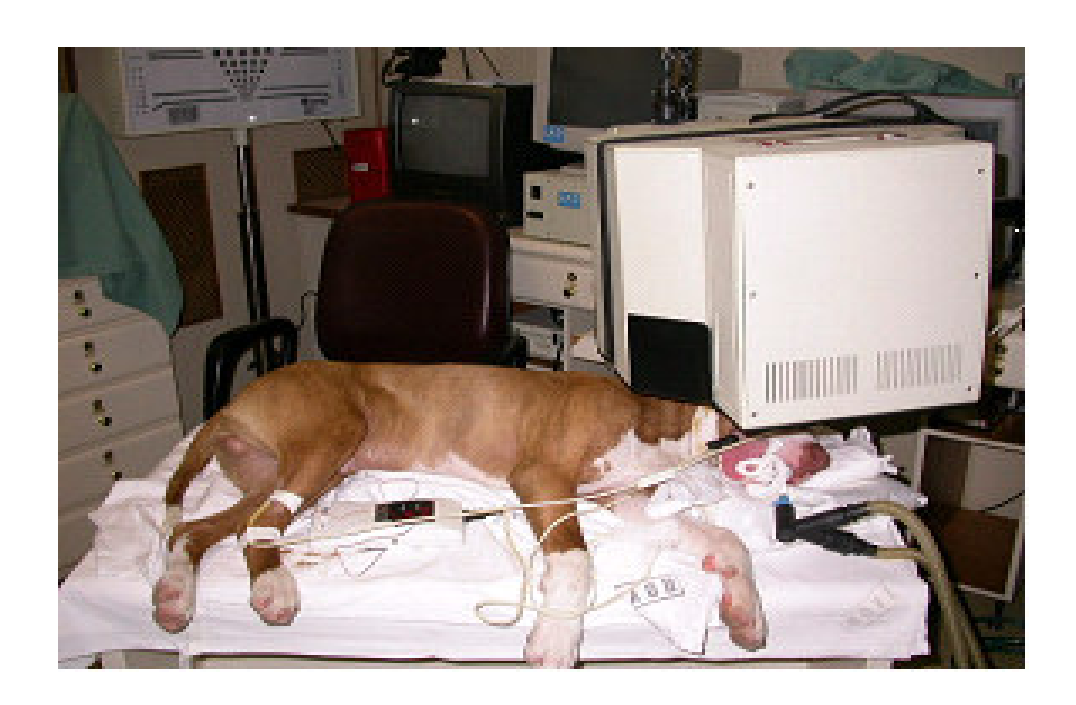
FIGURE 1 - FULL FIELD ERG PROCEDURE IN A PIT BULL DOG.

The animal was withheld of food for eight hours and of liquids for two hours. Tropicamide 1% was used to dilate the pupils and the animal was sedated with acepromazine (0.1mg/kg) and pethidine (2mg/kg) both intramuscularly. The cephalic vein was canulated and lactated Ringer's solution administered throughout the entire procedure at an infusion rate of 5 ml kg-<sup>1</sup> hour-<sup>1</sup>. Twenty minutes after premedication, induction of anesthesia was performed with propofol (5 mg kg<sup>-1</sup>) administered IV slowly in a single bolus. Orotracheal intubation was performed and 100% oxygen was offered through a rebreathing circuit of a small animal anesthesia machine and maintenance of anesthesia established with a continuous infusion of propofol (0.5mg.kg<sup>-1</sup>.min<sup>-1</sup>). To ensure that the ocular globe would stay centralized, rocuronium (0.3mg.kg<sup>-1</sup>) was administered.