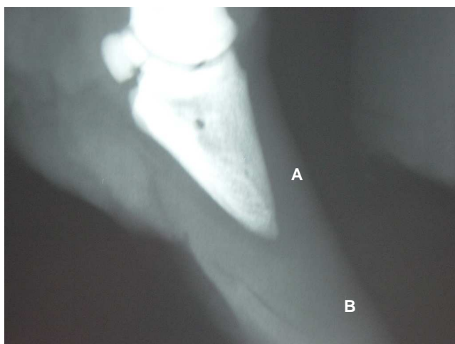
Figure 1 - Distal phalanx of third toe of a slaughterhouse culled sow. (A) phalanx deviation based on the absence of parallelism between the hoof wall and the phalanx. (B) wall horn overgrowth.

The main observed alterations are described as follows: eleven sows (61%) showed distal phalanx rotation of the third or fourth digit (figure 1), in a total of nineteen podal pieces (52%), whereas eight of these sows (44%) showed distal phalanx rotation in both digits. Osteolysis (figure 2) was observed in the fourth digits from five sows (28%), while another four sows (11%) showed periosteal proliferation of the third, fourth, or accessory digits. Angle measurements of deviation could not be done since there are no standard procedures for pigs.