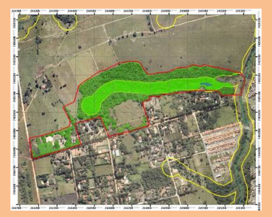
Figure 3: Park. Municipal Horto with its territorial delineation, vegetation cover and surrounding areas.