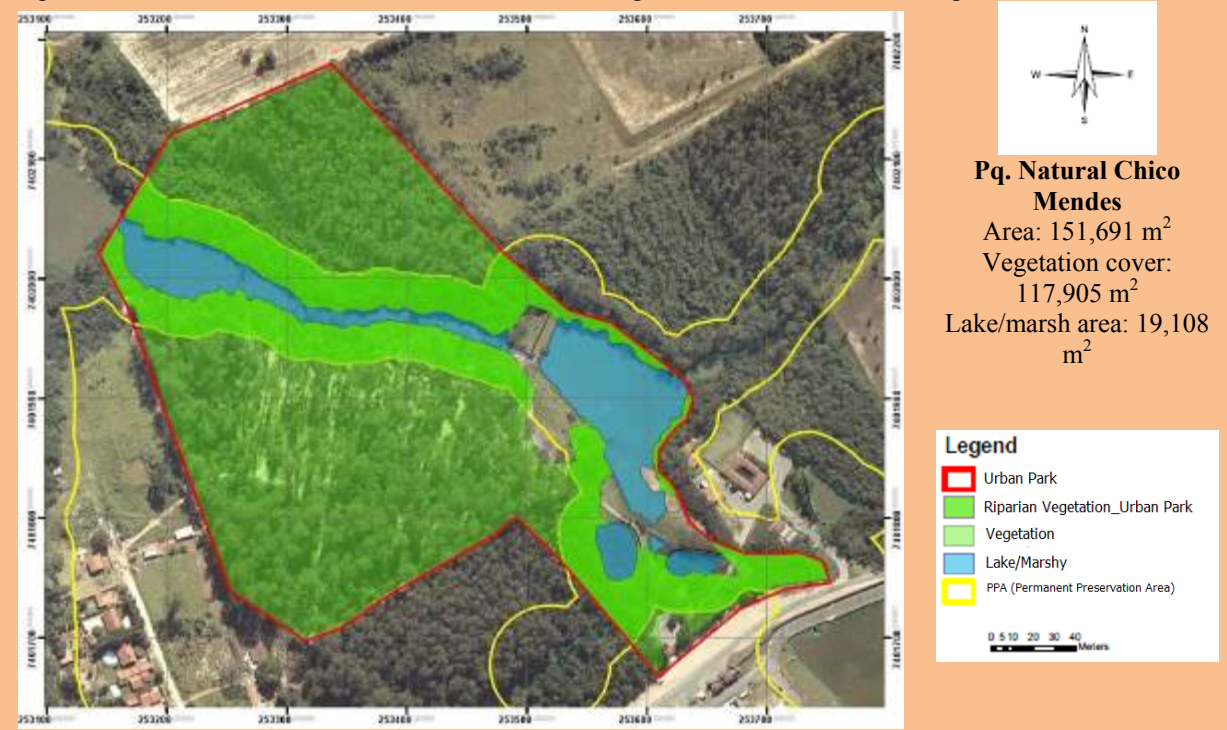
Figure 5: Park Chico Mendes its territorial delineation, vegetation cover and surrounding areas.

The result (Table 4) showed that Park Mario Covas (Figure 1) is better qualified with an index of 89 out of 100. This value shows the importance of this area in the current reality of Sorocaba. However, this space passes through what Vallejo (2009) considers lack of territoriality, given the absence of transversal public policies. This area has not had preparation and implementation of a management plan, not does it show minimal structure for receiving the public and research development. This park is located in a region of great environmental importance because it is one of the only water sources of the municipality where water is collected for public supply, besides it suffers great pressure from factories in its surroundings. Since 2005, a management plan and its effective implementation have been expected.