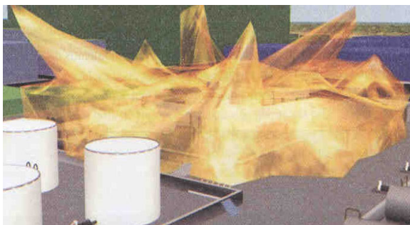
Figure 3. Unconfined explosion

Explosions that happen outdoors are said unconfined, as shown in Fig. 3.