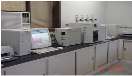
Figure 1. Laboratory of Analysis of Fuels

The Laboratory of analysis of fuels of UFPR / ANP began its activities in May of 2000. It is located in Pilot Factories A and B of UFPR. Now there are analyzed, approximately, 200 samples of fuels / month. About 2500 gas stations of Paraná are visited, 500 each month. The laboratory assists the Fiscalization of ANP and PROCON, too.