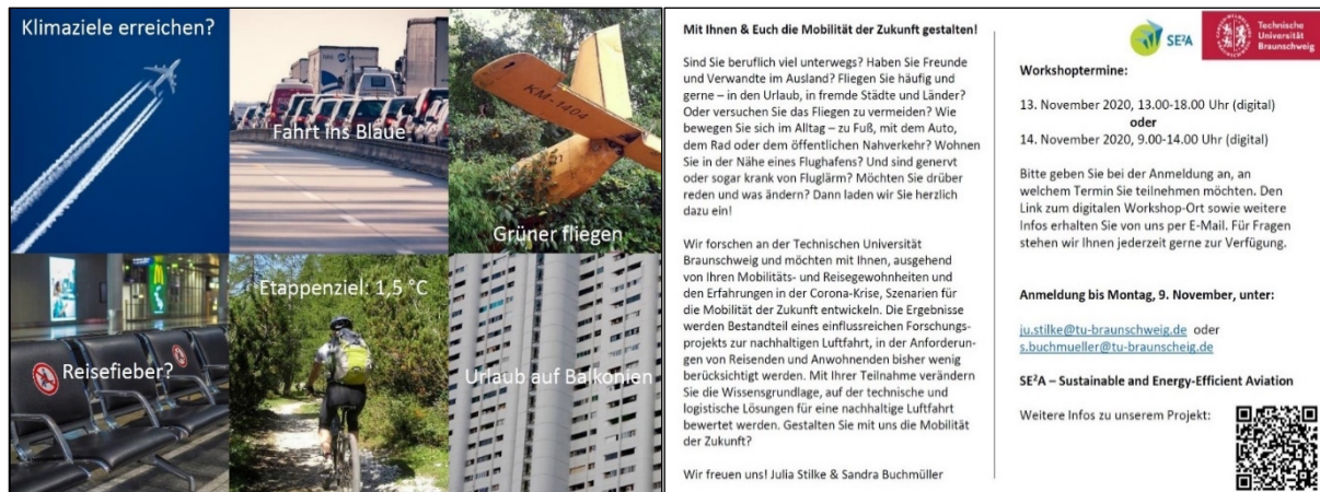
Fig. 2: Postcard for workshop participant recruitment