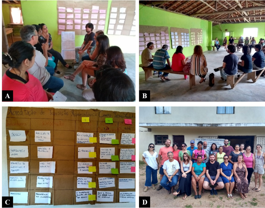
FIGURE 1 - Deliberative meetings for constructing the Bem da Terra Accreditation System Matrices. A) Focus group discussing the Social Dimension. B) Plenaries for presentation and discussion of the indicators evaluated in each Dimension at each Level. C) Environmental Dimension Matrix. D) Team responsible for building the Accreditation System.