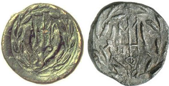
Figure 3 – (a) Reverse of bronze coin of Helike, Munzkabinett, Staatliche Museen zu Berlin (b) Reverse of silver coin of Helike, auction 15 October 2013.