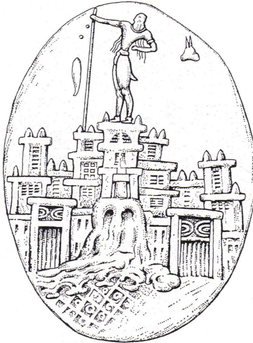
Figure 1 – Clay sealing from Kydonia, Crete (from Castleden 1990, 130, fig. 41).