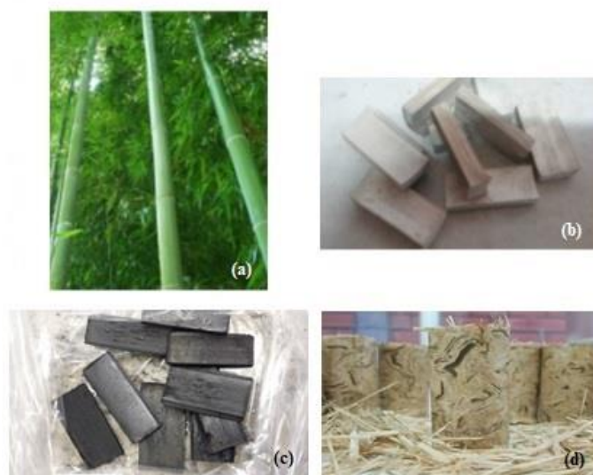
Figure 1. Three-year-old Phyllostachys bambusoides stems in the harvest area (a). Samples used to determine the physical properties and produce charcoal (b). Charcoal (c). Briquettes of the Phyllostachys bambusoides (d)