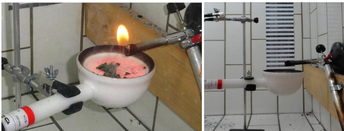
Figure 1. Demonstration of the experiment carried out with the epi radiator, in the chapel. On the left, detail of the pilot flame and on the right its location in the center of the disc.

Figura 1. Demonstração do experimento realizado com o epi-radiador, na capela. À esquerda, detalhe da chama piloto e à direita sua localização no centro do disco.