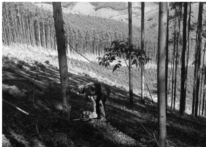
Figure 2: Position of the operators' hands at the time of cutting. Figura 2: Posição das mãos dos operadores no momento do corte.

In the study it was observed that all the operators involved are right-handed. This makes their posture when wielding the chainsaw to follow the pattern shown in Figure 2, in which the operator's right hand accelerates the machine and the left hand handles the machine when cutting.