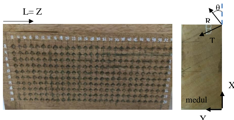
Figure 1. Block B of Cedrelinga cateniformis Ducke, ZX side with its respective squares.

Three wooden blocks from three Cedrelinga cateniformis Ducke trees in a sawmill located in the Pucallpa region of Peru were used for this study. The wooden blocks were oriented in the longitudinal direction and had dimensions of 12 x 40 x 60cm. The block edges were labelled as X, Y, and Z axes. The direction of the longitudinal face ( Z = L ) and the radial direction (R) of each block were determined by measuring the Angle in relation to the X axis, obtaining values of 27°, 31.5° and 23° for the blocks designated as A, B and C, respectively. In Figure 1, Block B is shown with the orthotropic directions of the blocks: longitudinal (L), radial (R) and tangential (T). The determination of the angle in relation to the growth rings is important, since its variation related to the length of the whole sample increases the variability of the results as indicated by Jaskowska and Walach (2016).