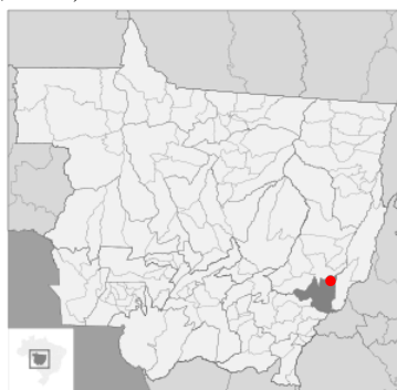
Figure 1. Geographic location of the state, city and study site.

Data was collected in the crop fields of Embrapa in partnership with Agropecuária Fazenda Brasil, in Barra-do-Garças City (MT), at coordinates 14° 59'25.34"S and 52°16'21.05". The city is located in Southeastern Mato Grosso State (Figure 1), in a transition area between the Amazon and Cerrado biomes (MARACAHIPES et al. , 2011). Tropical Savanna (Aw) is the local climate, with two well-defined seasons: dry (May to September) and rainy (October to April) (SOUZA et al. , 2013).