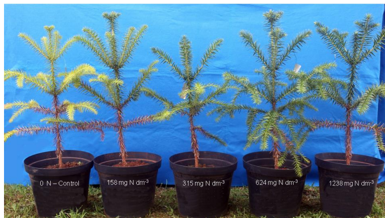
Figure 2. A. angustifolia fertilized with different levels of N and fixed rates of P (469 mg dm -3 ) and K (469 mg dm -3 ) at 21 months-old.