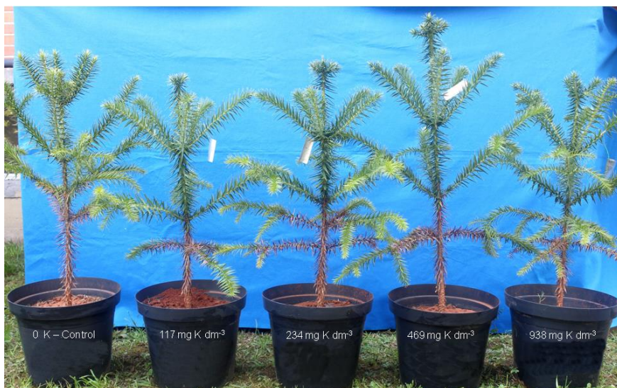
Figure 5. A. angustifolia fertilized with different levels of K and fixed rates of N ( 624 \text{ mg dm}^{-3} ) and P ( 469 \text{ mg dm}^{-3} ) at 21 months-old.