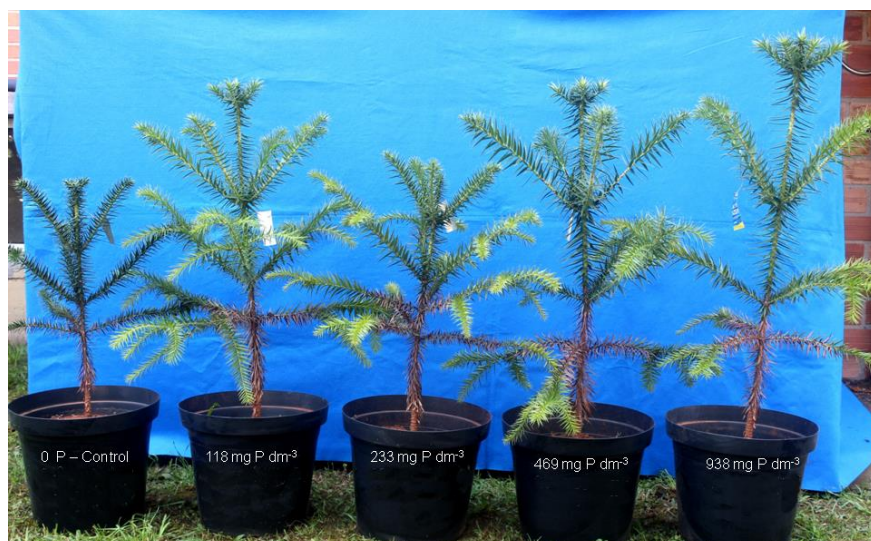
Figure 4. A. angustifolia fertilized with different levels of P and fixed rates of N ( 624 \text{ mg dm}^{-3} ) and K ( 469 \text{ mg dm}^{-3} ) at 21 months-old.

P deficiency symptoms were evident in the control treatment (no P addition). The main symptoms were dark green needle coloration, scarcity of secondary branches, under developed apical buds, and shorter internode segments in relation to the other treatments (Figure 4).