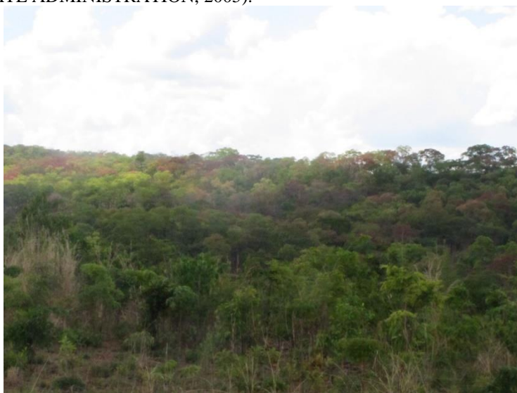
Figure 1. Miombo Forest in Mossurize.

The average annual evapotranspiration is about 1,170 mm. Average temperatures range around 20 ° C, with a maximum average of 25 ° C and a minimum average of 15.1 ° C. It has a normal period of growth, with a dry period of 95 days, an intermediate period of 120 days - between the dry and wet period - and a wet period that extends for 150 days. The wet season begins in the first half of November and ends in the first half of April (MINISTRY OF STATE ADMINISTRATION, 2005).