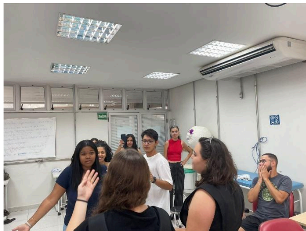
Image 3 – Terapia Ocupacional Social e Inclusão Radical: Enfrentamento das Violências Institucionais no Âmbito Universitário Workshop held at Semuni 2023