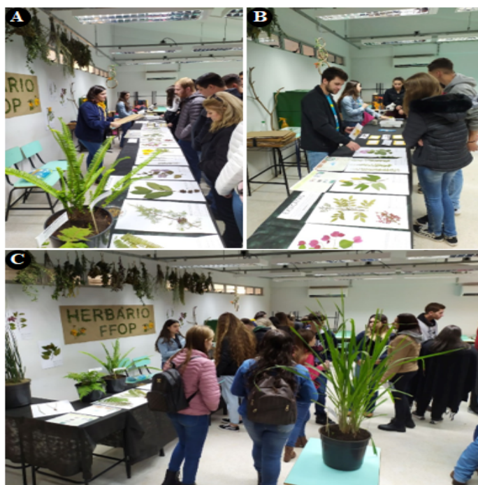
Figure 3 – (a); (b), and (c) Student presenters promoting the activities of the FFOP Herbarium to visitors at the project booth during the 2023 “Come to UFPR” event

To further increase the outreach of the herbarium, materials were produced for distribution to visiting audiences, including an informational brochure (Figure 4) about the work conducted in a herbarium, detailing the steps involved in preparing a herbarium specimen and information about the FFOP Herbarium collection, along with 150 “mini-specimens” featuring the species Pyrostegia venusta (Ker Gawl.) Miers (golden trumpet vine), Alternanthera sp., and Cuphea gracilis Kunth (false heather), as a way to provide visitors with a souvenir from the exhibition.