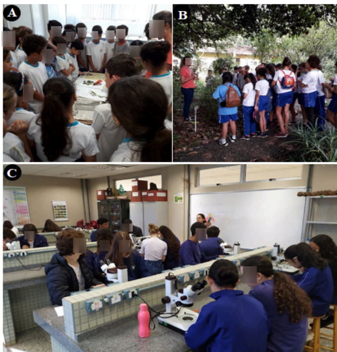
Figure 1 – (a) Workshop on the herborization of botanical material conducted at the FFOP Herbarium; (b) Visit by students to the Medicinal and Aromatic Plants Garden of the Palotina Sector; (c) Workshop on floral morphology held in the Plant Systematics Laboratory.

In this environment, walks were conducted among the garden beds with visitors, accompanied by explanations, aiming to guide participants so that they could observe the plants in their natural setting, perceiving the textures and scents of the cultivated species before their collection for dehydration and the preparation of herbarium specimens (Figure 1b). Most of the plants on site are labeled with plaques containing both the common and scientific names of the species, along with their main therapeutic uses, making it possible to learn more about the benefits of using medicinal and aromatic plants in health care.