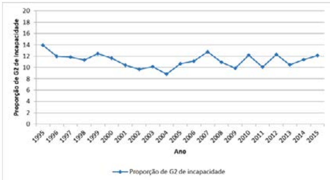
Figure 2 - Proportion of new leprosy cases with grade-2 physical disability in the diagnosis in Minas Gerais. Period: 1995-2015. Belo Horizonte, MG, Brazil, 2019