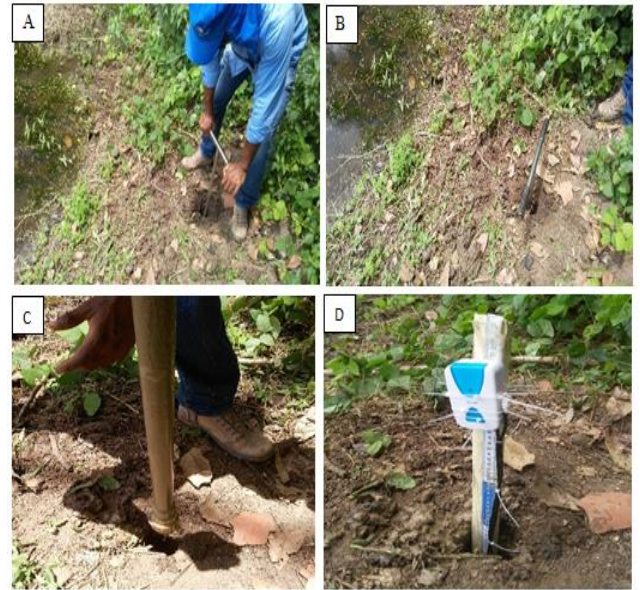
Figure 4. Procedure step by step. A - Well bore; B - Depth check; C - Removal of water to "zero" the current level of the sheet; and D - Equipment indicating the variation of the level of the water table.

In order to determine and obtain the results, a time variation of 10 minutes between each reading was established, that is, at each time variation, a height reading was made at the water level in the well. In order to estimate the hydraulic conductivity, several empirical formulas have been proposed, such as Ernst's, which is the model that most closely approximates the soil situation studied. The proposed model is presented by Equation 1: