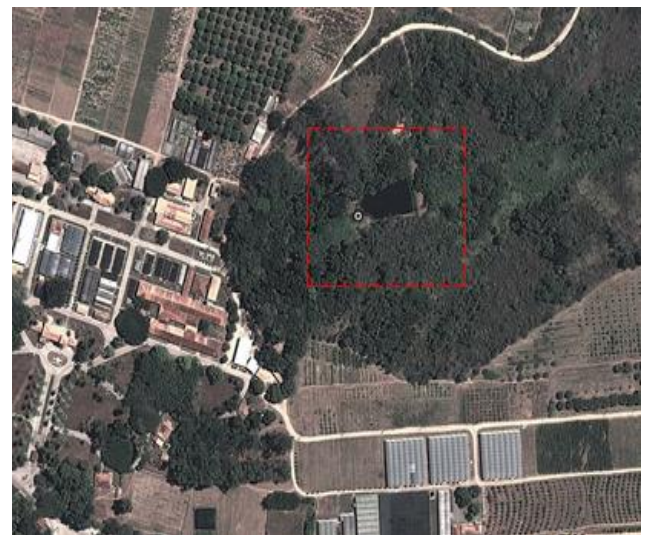
Figure 1. Location where the experiment was performed.

The experiment was carried out at Embrapa Manioc and Fruticulture (EMBRAPA), located in the municipality of Cruz das Almas-BA, with geographic coordinates of 12°4'S; 39°06'W and altitude of 225 m. In the spring area, 3 readings (Figure 1) were taken from the soil with a diameter of 8 centimeters, using a tread, until the water table level was exceeded (Figure 2).